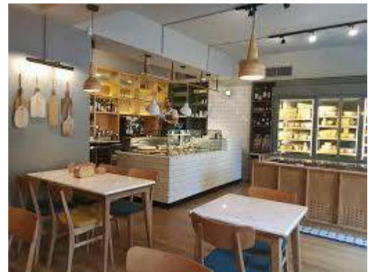
WINE & CHEESE