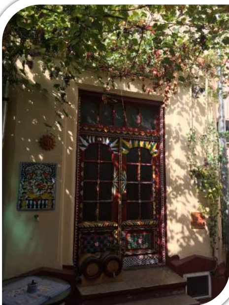
Showing each other the most unusual places to eat...