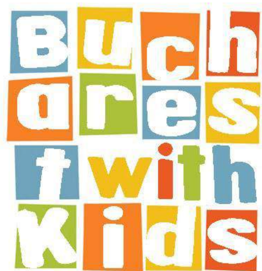
MUM TOTS BUCHAREST KIDS