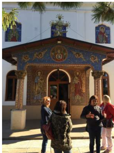
Exploring the countryside and fascinating places together.