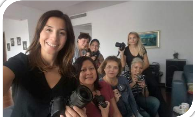
Learning how to take great photos together.