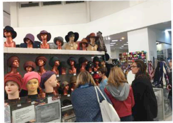
Checking out the best shopping venues together.